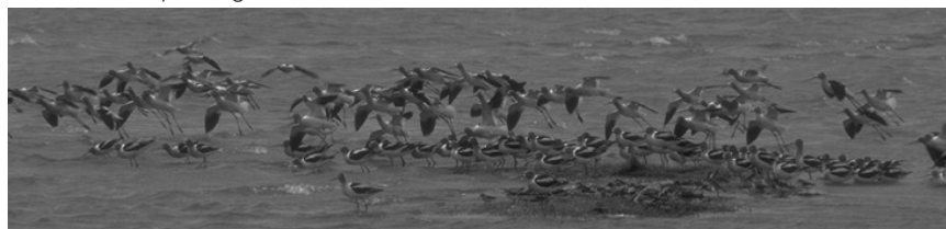
American Avocets on migration. Avocets may be attracted to habitats in winter that expose some to toxic chemicals including selenium found in irrigation canals and cyanide found in gold-mining tailings ponds.