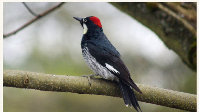
Acorn woodpeckers are one of many species dependent on oak habitat.

Willamette Valley landowners have a long history of stewardship. Over 47% of Oregon's planted vineyard acres are certified sustainably farmed, demonstrating a commitment to protecting biodiversity and wildlife and conserving natural resources such as soil health and water quality. Close to 57% of private forestlands in Oregon are certified to a third party standard for sustainable forest management.