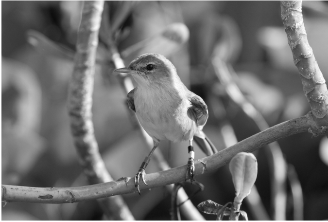
Correction: The photo on page 38 of the Sept/Oct 'Elepaio was published incorrectly. This is the correct photo of a Millerbird posing the morning after release on Laysan.