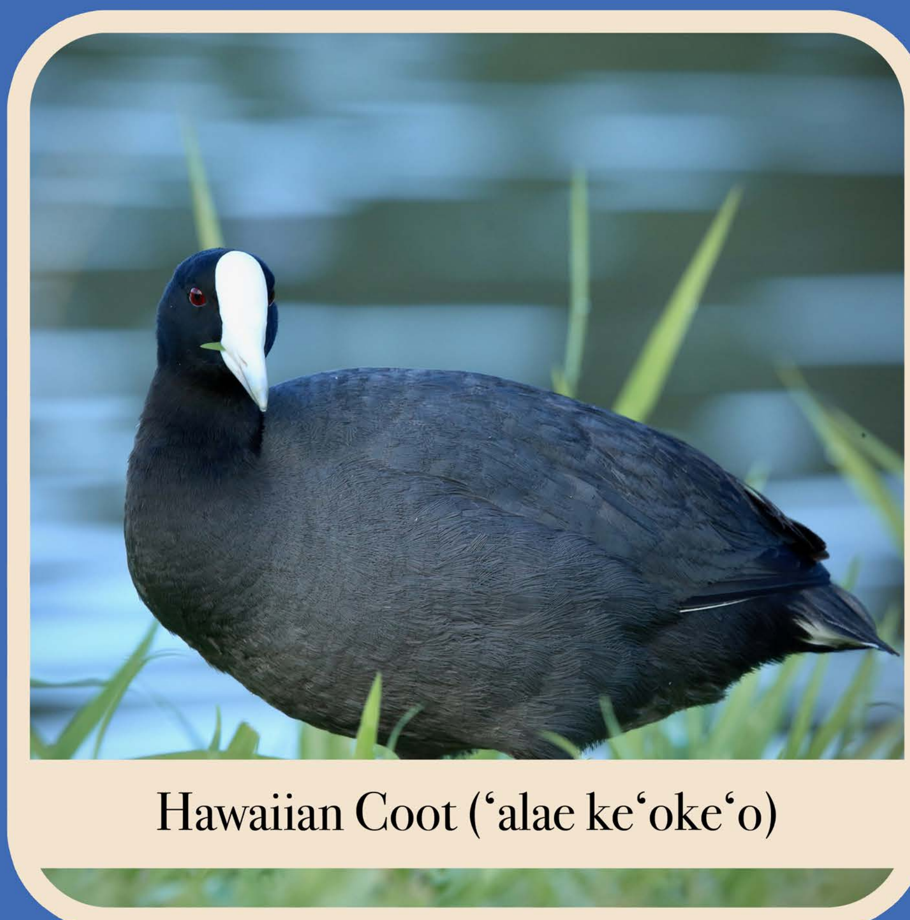
Hawaiian Coot (ʻālae keʻokeʻo)