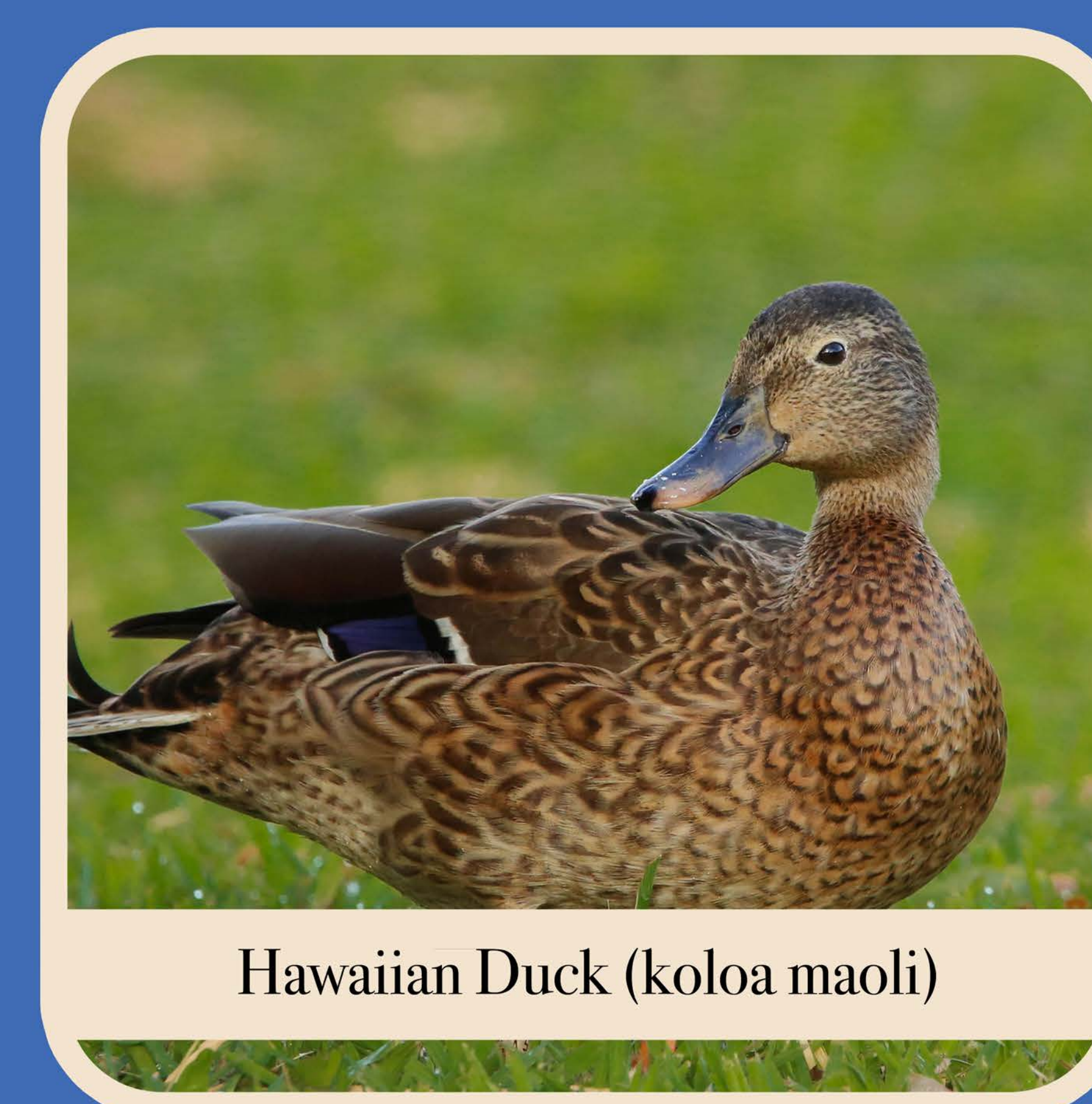
Hawaiian Duck (koloa maoli)