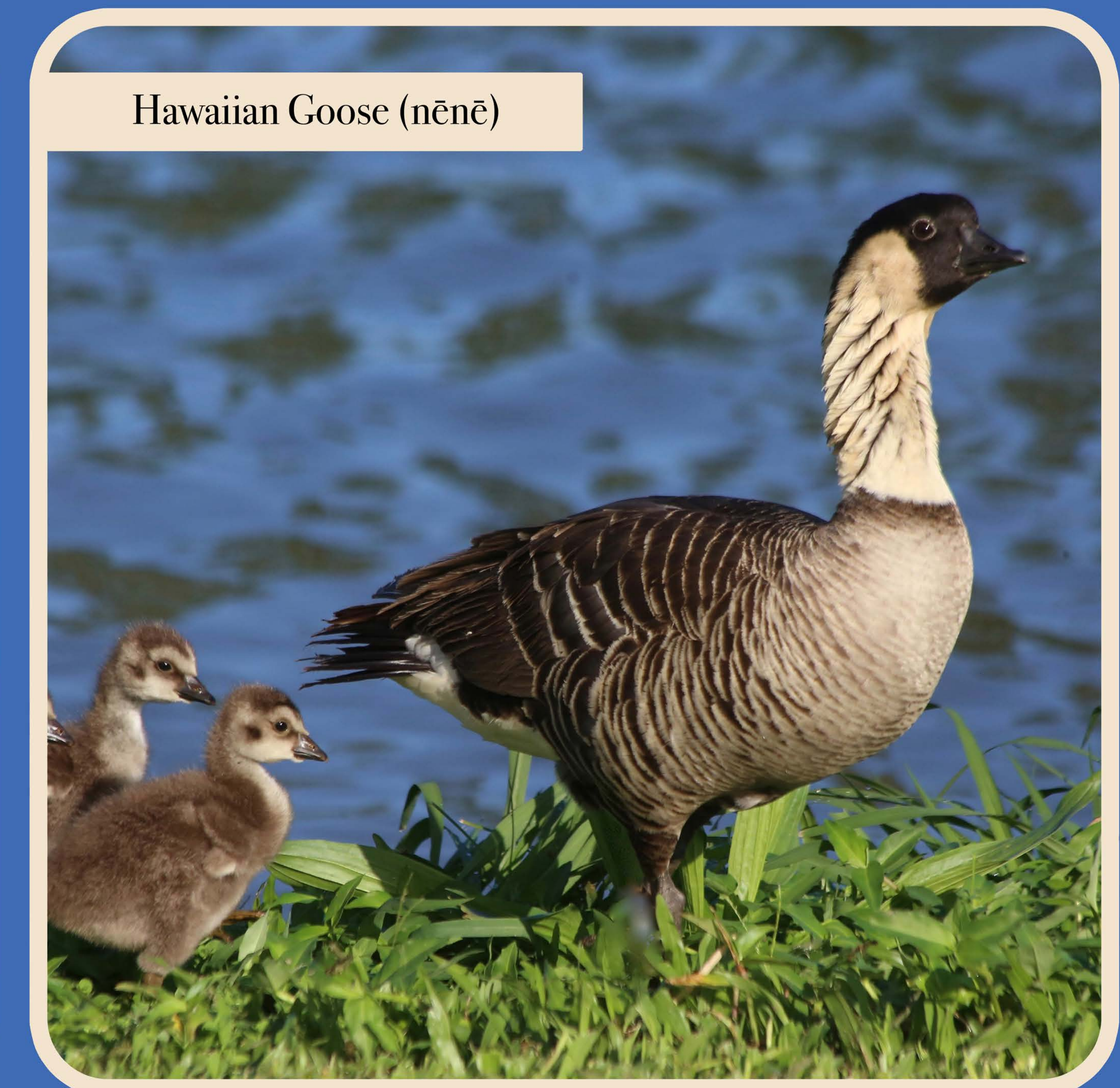
Hawaiian Goose (nēnē)