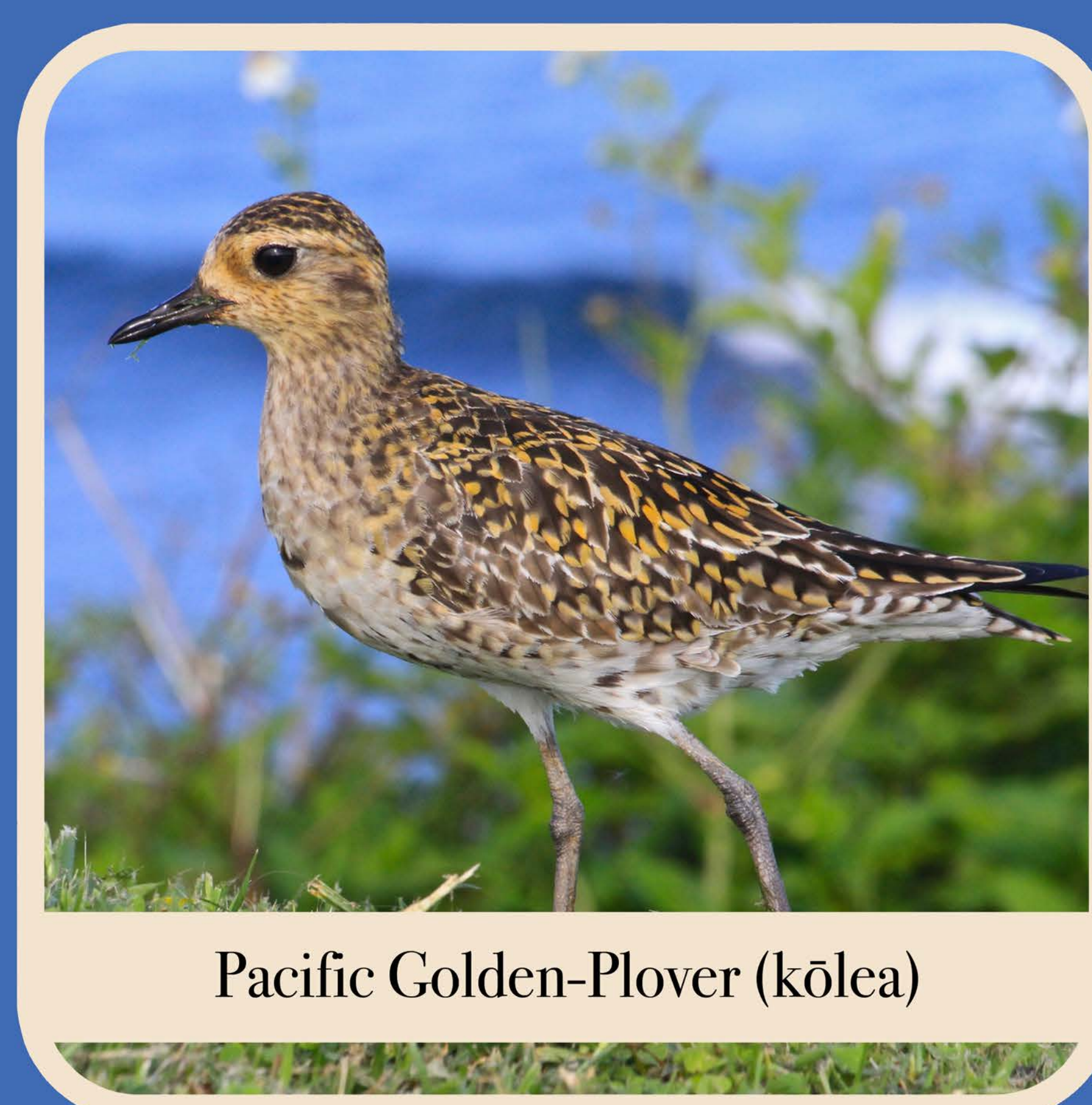
Pacific Golden-Plover (kōlea)