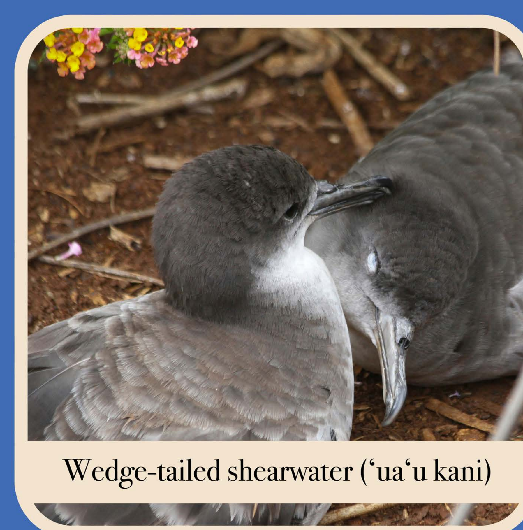
Wedge-tailed shearwater (ʻuaʻu kani)