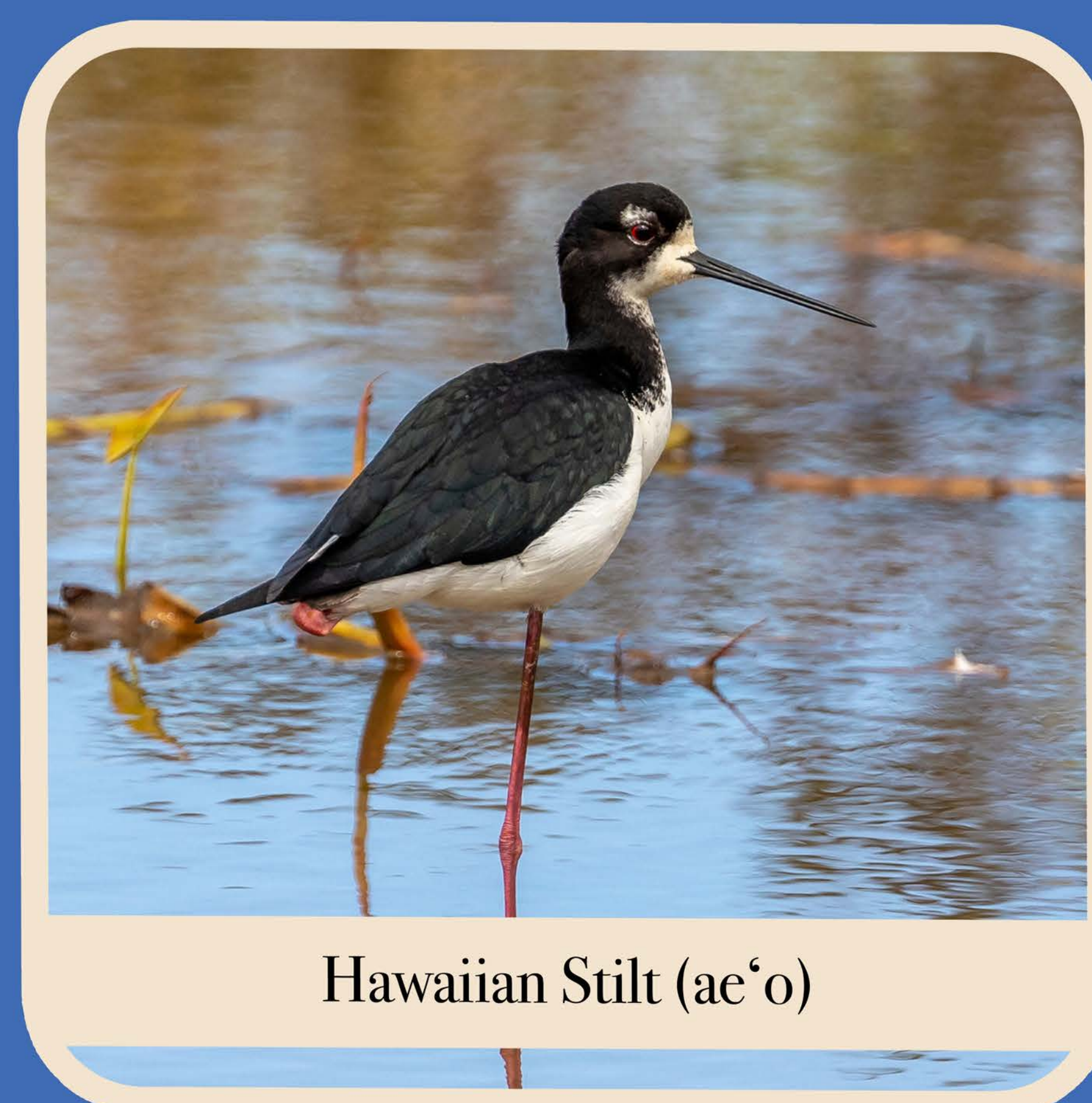
Hawaiian Stilt (aeʻo)