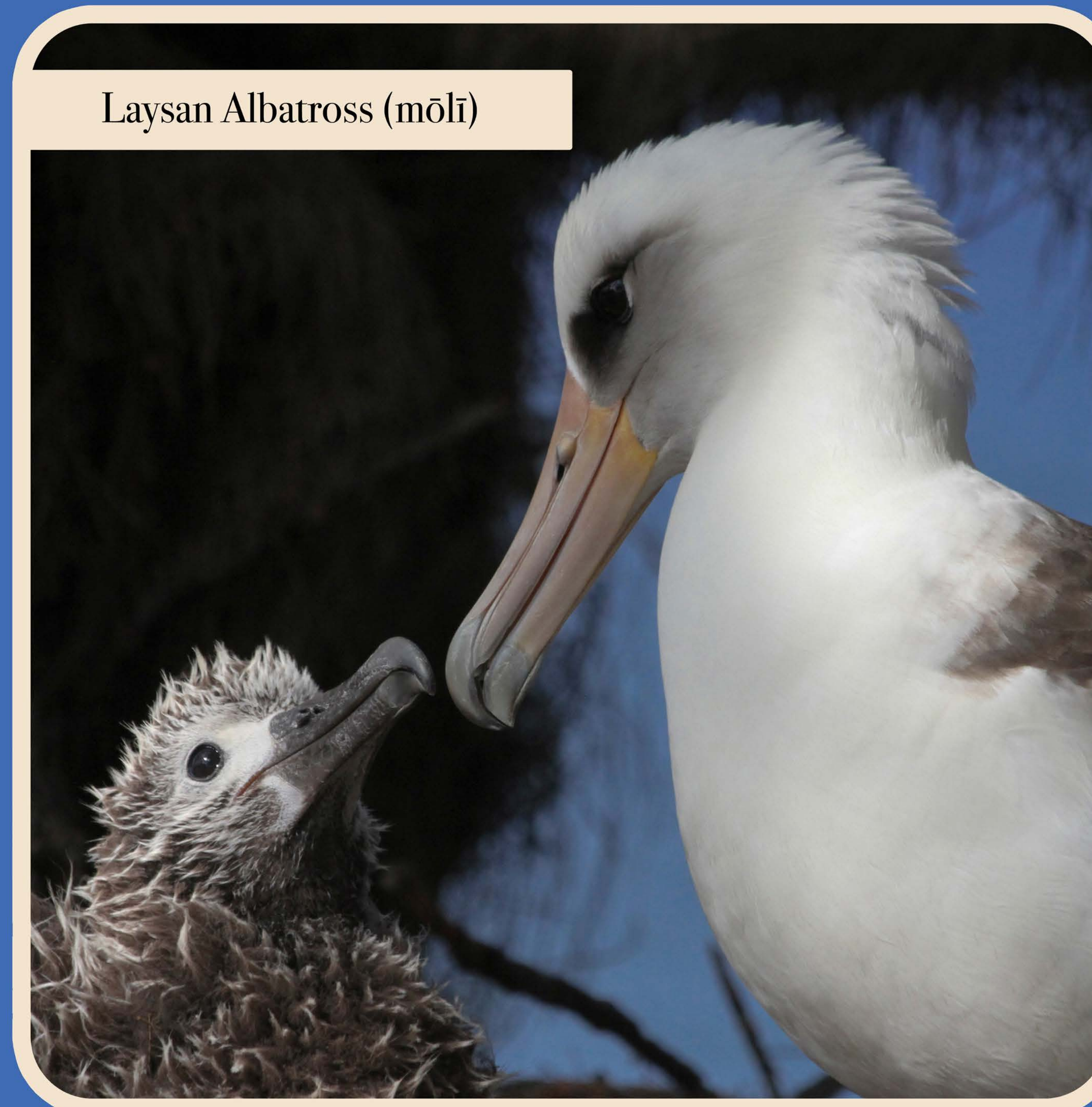
Laysan Albatross (mōlī)