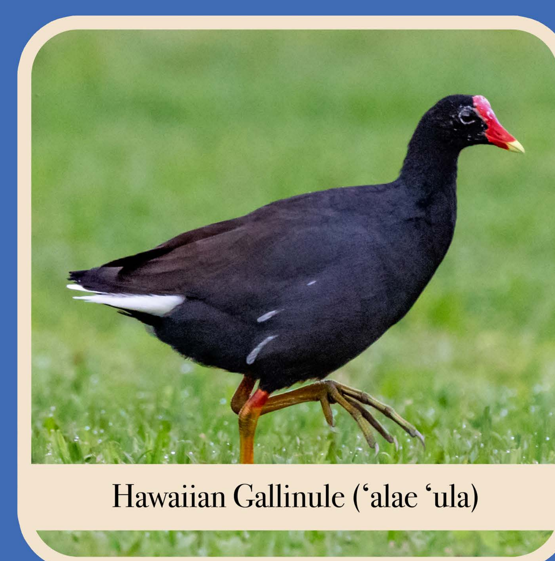
Hawaiian Gallinule (ʻālae ʻula)